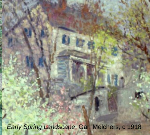
Early Spring Landscape, Gari Melchers, c 1918