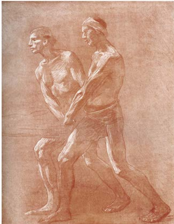
Study for The Arts of War , c. 1896. A Print from the Magazine of Art, Cassel and Company, 1900. the completed mural is now in the Library of Congress.