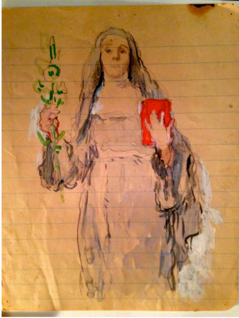
Study for History of Detroit - The Spirit of the Northwest , c. 1920. Gari Melchers Home and Studio at Belmont.