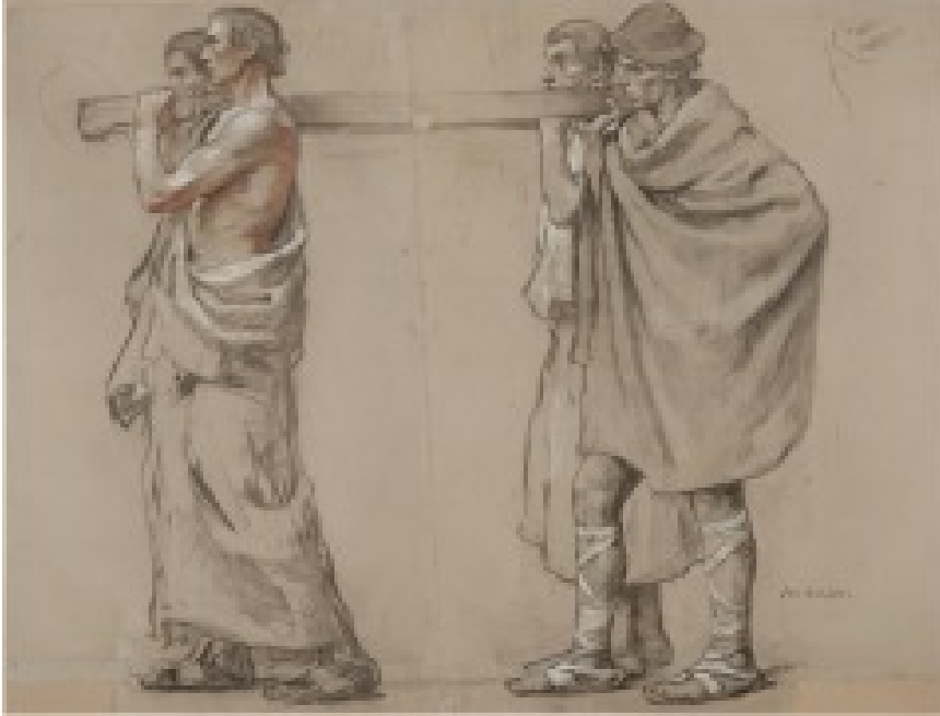
Peace (for Mural Decoration in Congressional Library, Washington, D.C.), c. 1900. Charcoal on paper, 37 3/4 x 48 3/8 x 3/4 in. (95.88 x 122.87 x 1.91 cm). Carnegie Museum of Art.