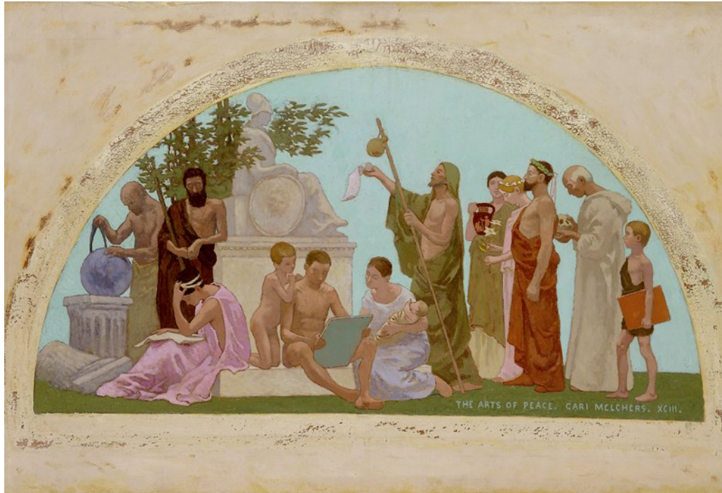
Study for The Arts of Peace , 1893. Oil on canvas, 15 1/8 x 29 x 1 in. (canvas); 22 x 36 1/4 x 1 in. (outer frame). Minneapolis Institute of Art. Completed mural is now in the graduate library at the University of Michigan, Ann Arbor.